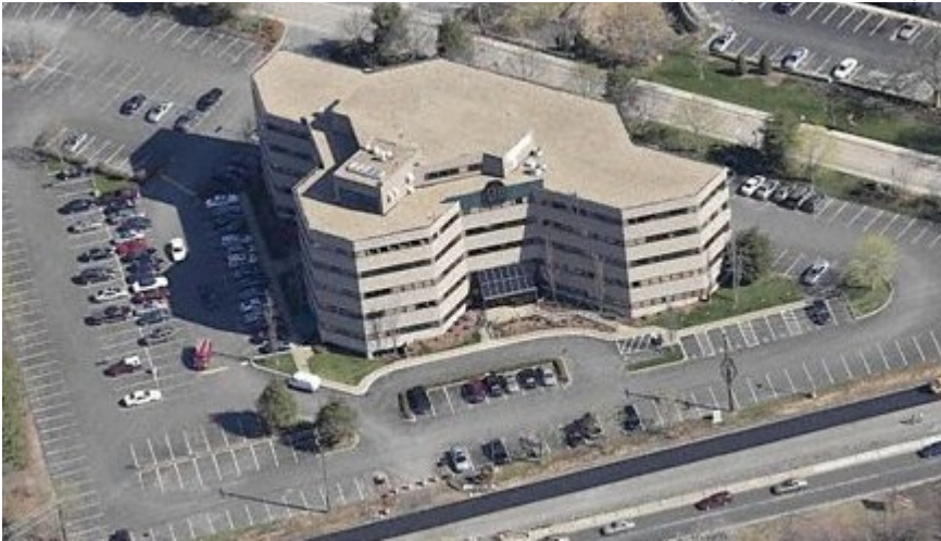
Building Aerial View

33 BOSTON POST ROAD WEST, SUITE 230, MARLBOROUGH, MA - 01752, P: 508.787.0882